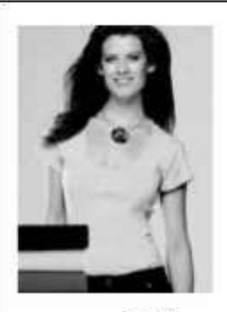
£4 each / £6 for 2