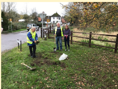
Bulb planting, November 2020