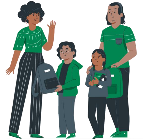
PEOPLE NEEDING TO CARE FOR CHILDREN OR RELATIVES THAT AREN'T WELL