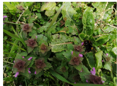
Red Dead Nettle