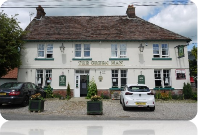
Church Lane, Toppesfield, Halstead, Essex CO9 4DR

We hope you are enjoying the summer season, come rain or shine!