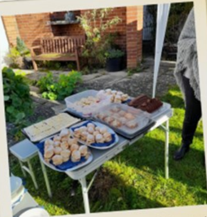
Delicious cakes made and donated by our amazing volunteers.