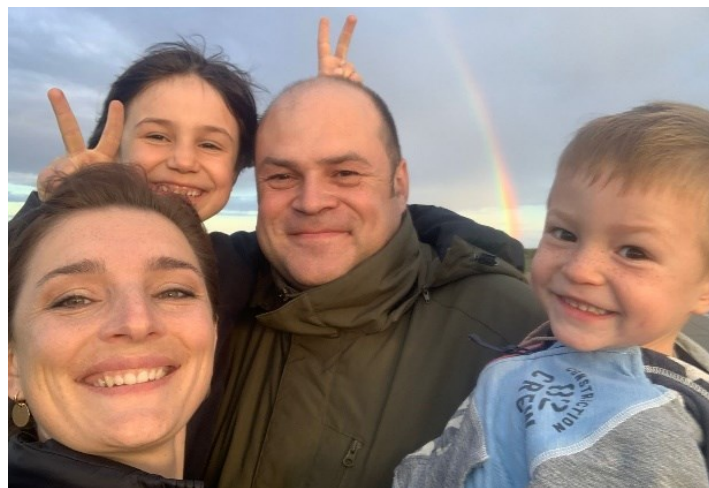
Home again with Daddy!

Meanwhile with winter approaching and the Russians becoming evermore violent in their actions, let's not forget our Ukrainian friends and their families.