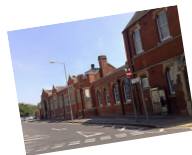
Ashdown Road Marble Hall