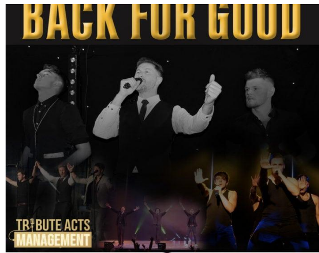
Recreating All The (+)AKE THAT Magic

The Take That tribute organised by the Academy Kimbolton Primary Parents Association was very successful with over 100 attending and raised a significant sum for the benefit of KPA.