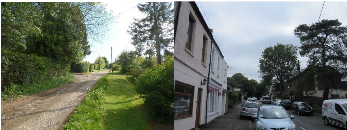
Outer village- Maesmaur Road