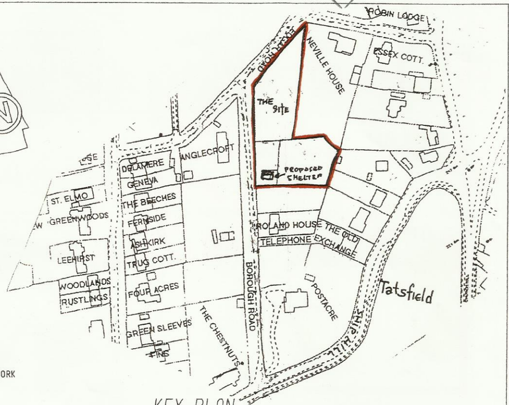
KEY PLAN 1:1250