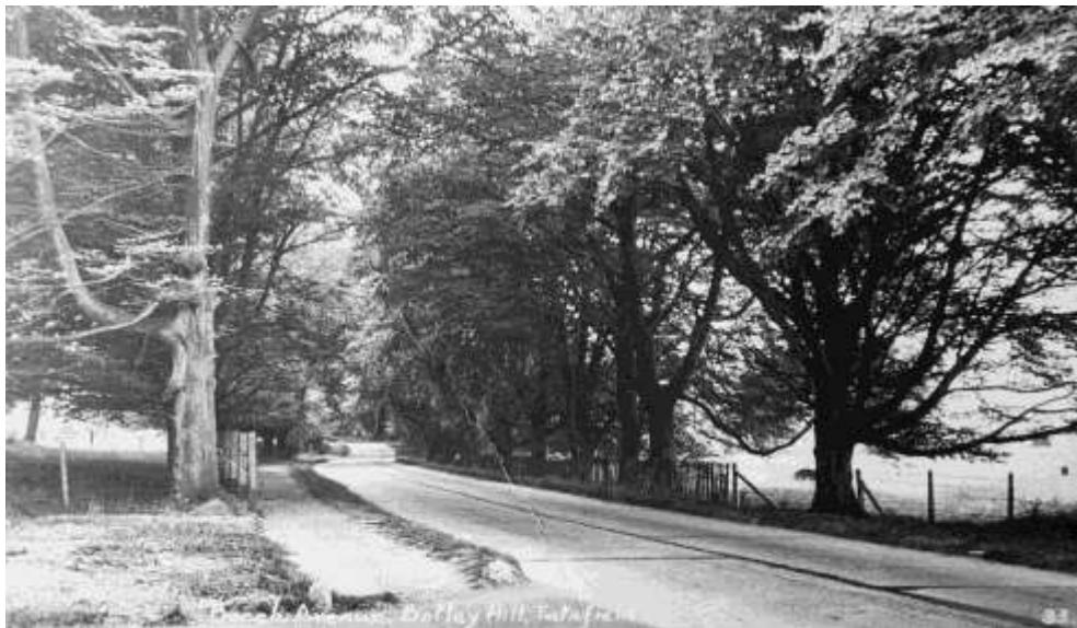
The Limpsfield Road at Botley Hill in the 1920s – concrete, no tarmac