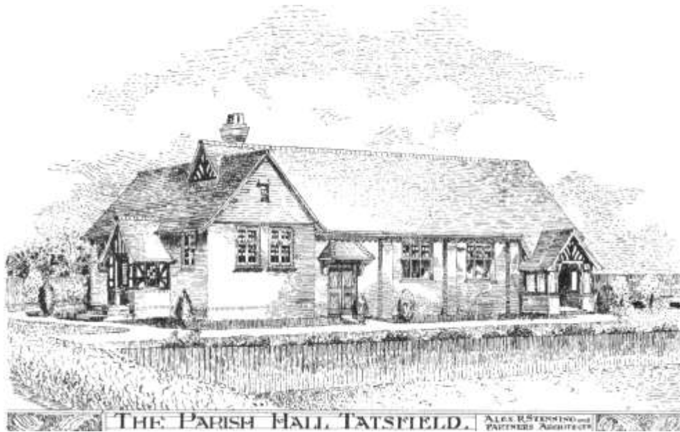
The architect's drawing -1909