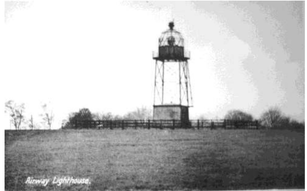
Beddlestead Lane - Air Traffic Control navigation aid in the 1930s