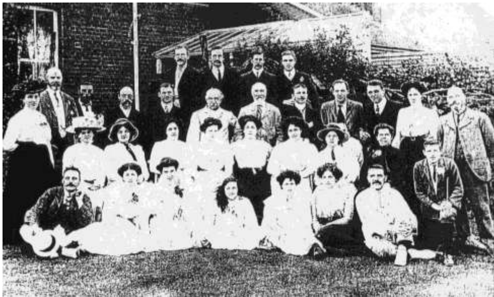
A social gathering in the Old Ship garden before the First World War