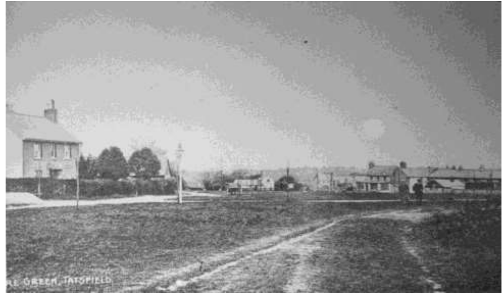
A tree-less Westmore Green at the end of the 19 th century