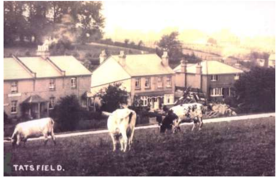
... and cows grazed on Tatsfield Green