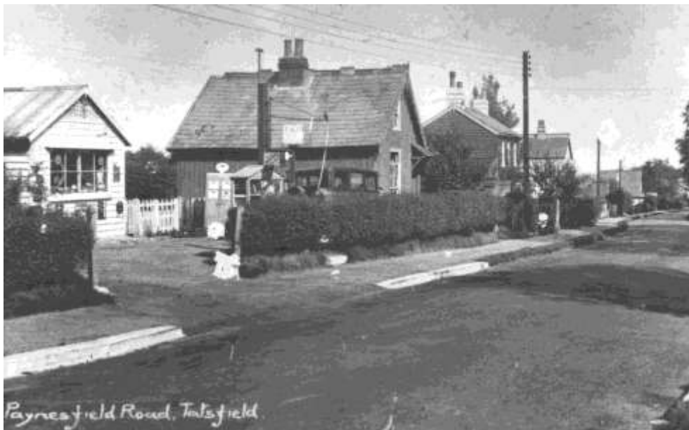
An early view of Frank Watson's garage in Paynesfield Road