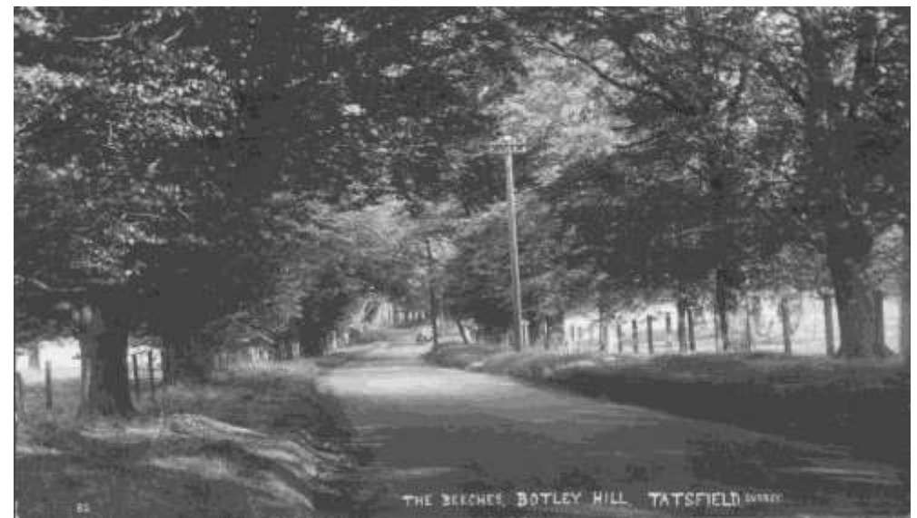
A new road surface – beech trees line the road in the 20 th century