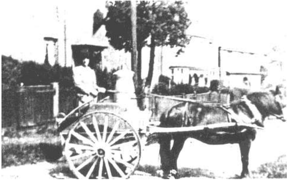
There was a time when the milk came by horse and cart...