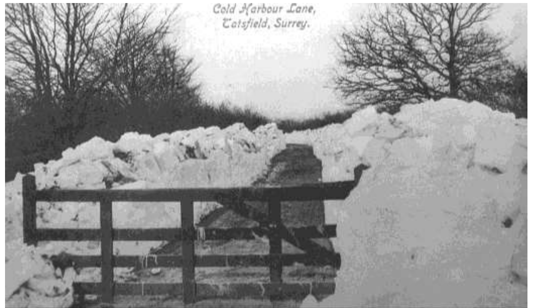
Coldharbour Beeches – the top of White Lane