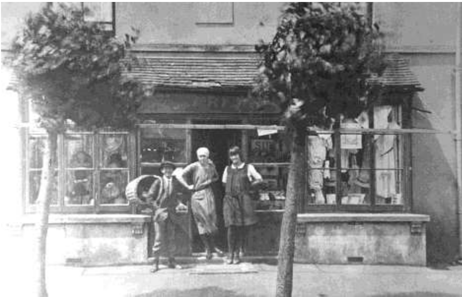
One of the shops in Westmore Road in the 1920s