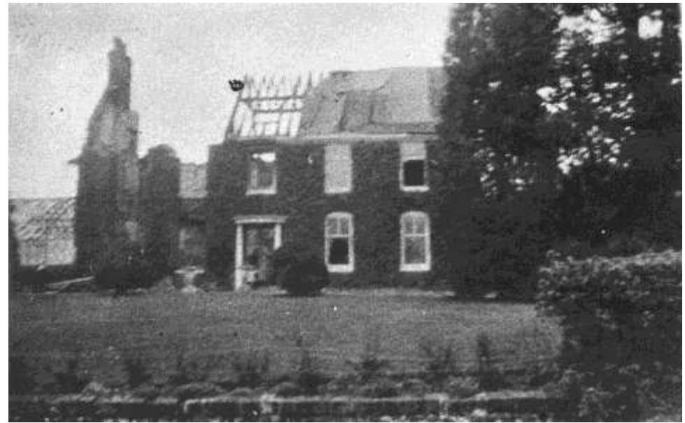
Fire at the Manor House in 1930