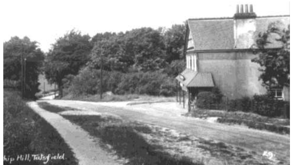
Ship Hill in the 1920s