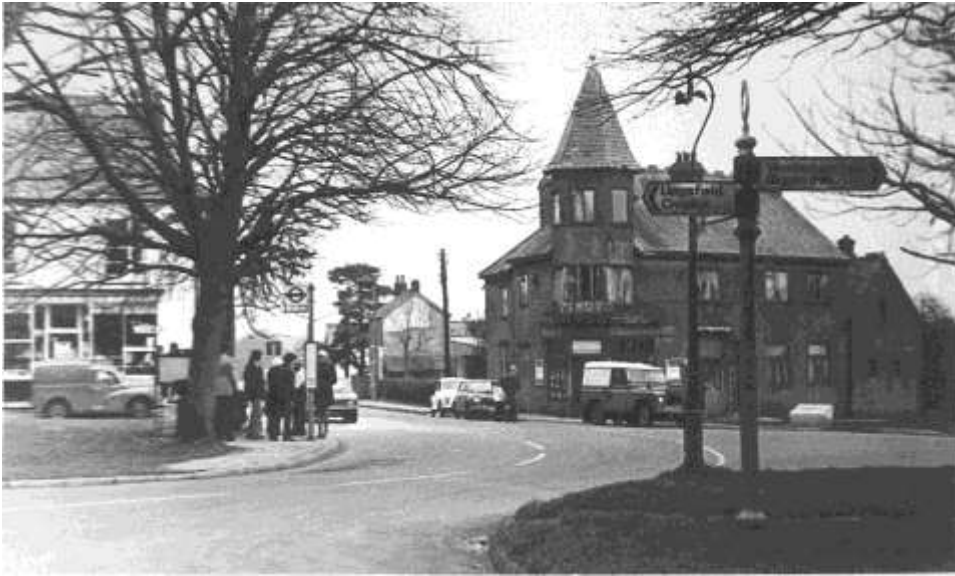
The village centre in the 1970s