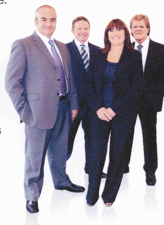
local and independent estate agency at its best