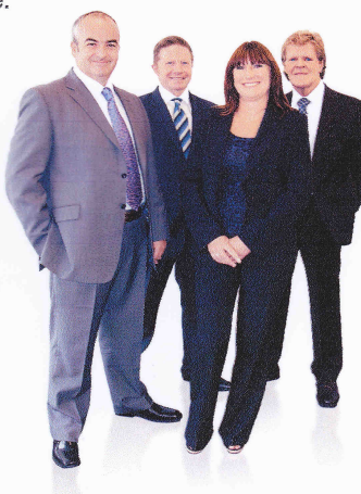
local and independent estate agency at its best