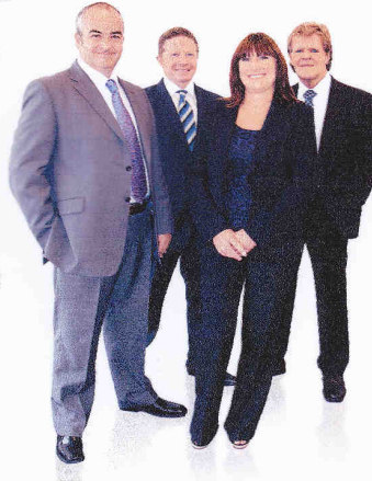
local and independent estate agency at its best