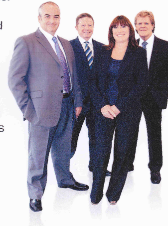
local and independent estate agency at its best