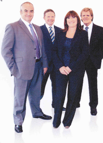
local and independent estate agency at its best