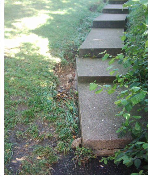
Left - The notice posted in Windsor Drive announcing the application. Right - The back entrance steps to Windsor Drive which would become a public path.