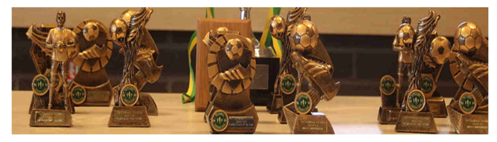
Figure 1 – Trophies from our awards ceremony

CELEBRATING OUR SUCCESSES! We held our annual awards ceremony where we celebrated the successes of each of our teams which we are always incredible proud of. We thank High Wycombe Rugby Club for hosting us again this year. It was a wonderful event with many trophies deservedly given out.