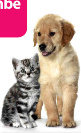
Vets4-Pet: Rutting your pet first

133 Amersham Road, High Wycombe, HP13 5AD Opening times: 8.30am - 7pm Mon-Fri, 9am - 12pm Sat