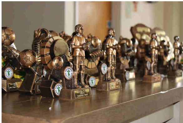
Figure 1 – Trophies from our awards ceremony

We did have our awards ceremony, held at Booker Judo Centre, with pizza, drinks and prizes! Everyone had a wonderful time and its one of the best parts of the season. Everyone received a medal for their participation during the season and there were some individual awards for each age group.