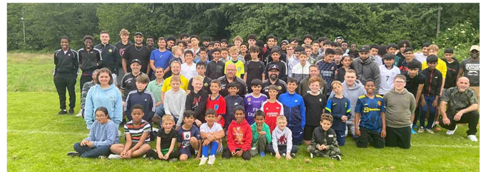
Figure 2 – End of Season Club Photo

Celebrations from last season were on top form, with bouncy castles, pizza and mini matches!