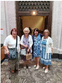
Visit to the Bank of England Museum

We were also pleased to congratulate our Quiz Team – having come third in the Buckinghamshire competition, they were forwarded to the Inter-County final, where they again came third equal – a magnificent effort.