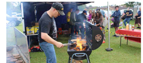
Figure 1 – Some pictures from Hazlemere Fete 2023

Celebrations from last season were on top form, with bouncy castles, pizza and mini matches!