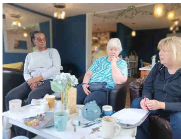
Book Club meeting