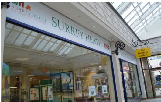
33 Obelisk Way, Camberley