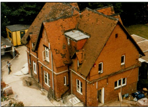
Newstead, Knoll Road