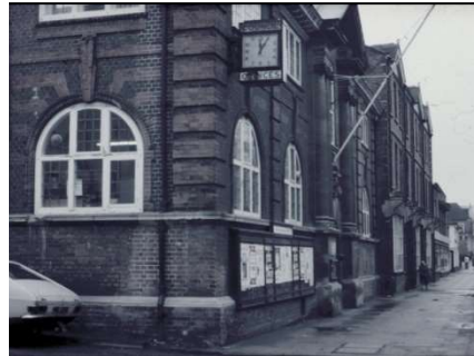
Frimley and Camberley UDC Offices, London Road