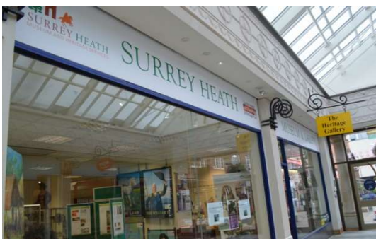
33 Obelisk Way, Camberley