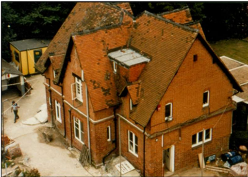
Newstead, Knoll Road