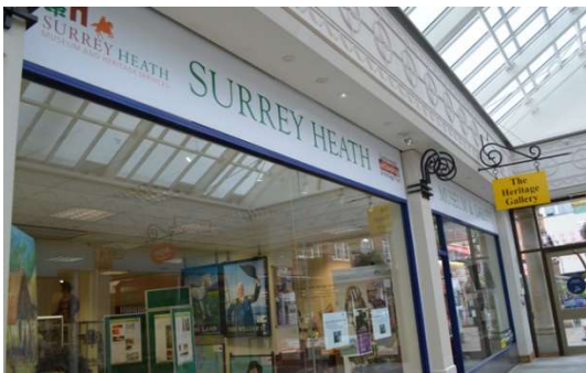
33 Obelisk Way, Camberley