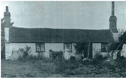
West End, c.1900