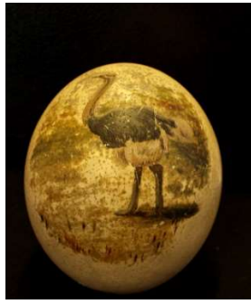
Painted Ostrich Egg – late 1800s