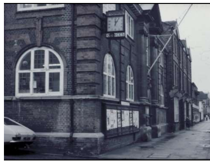
Frimley and Camberley UDC Offices, London Road