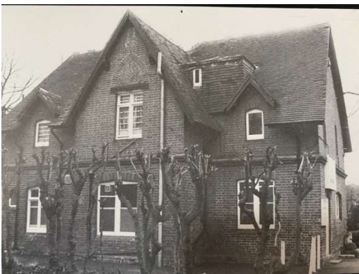
Newstead, Knoll Road