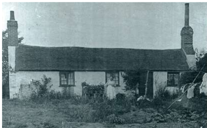
c. 1900 Family cottage at West End