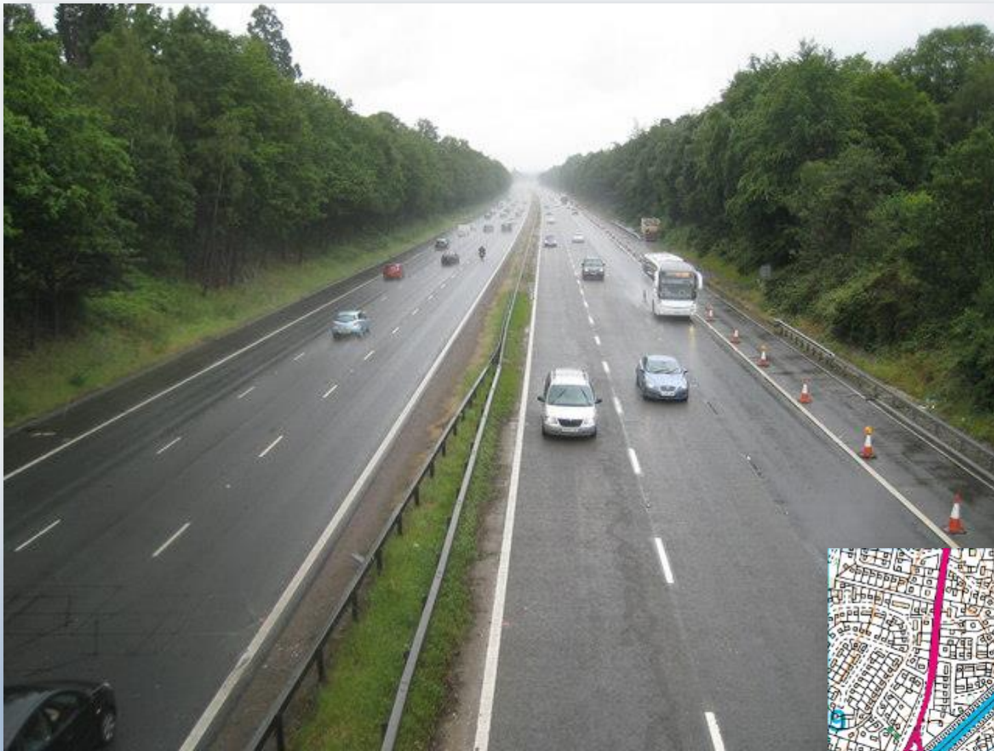
M3 near Camberley. Taken from the over pass where the A235 Portsmouth Road crosses the motorway.