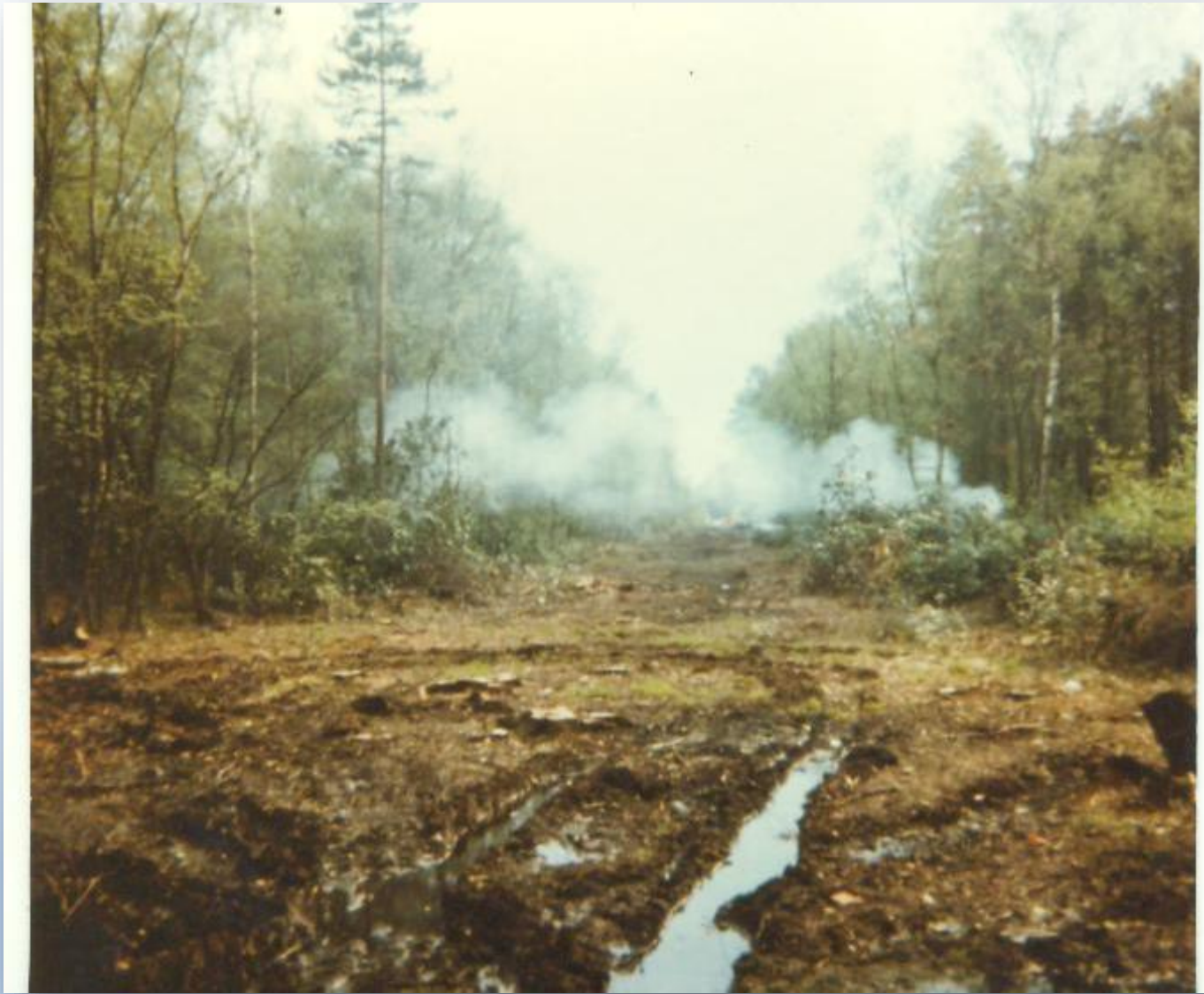
Trees Being cut for M3 in 1967