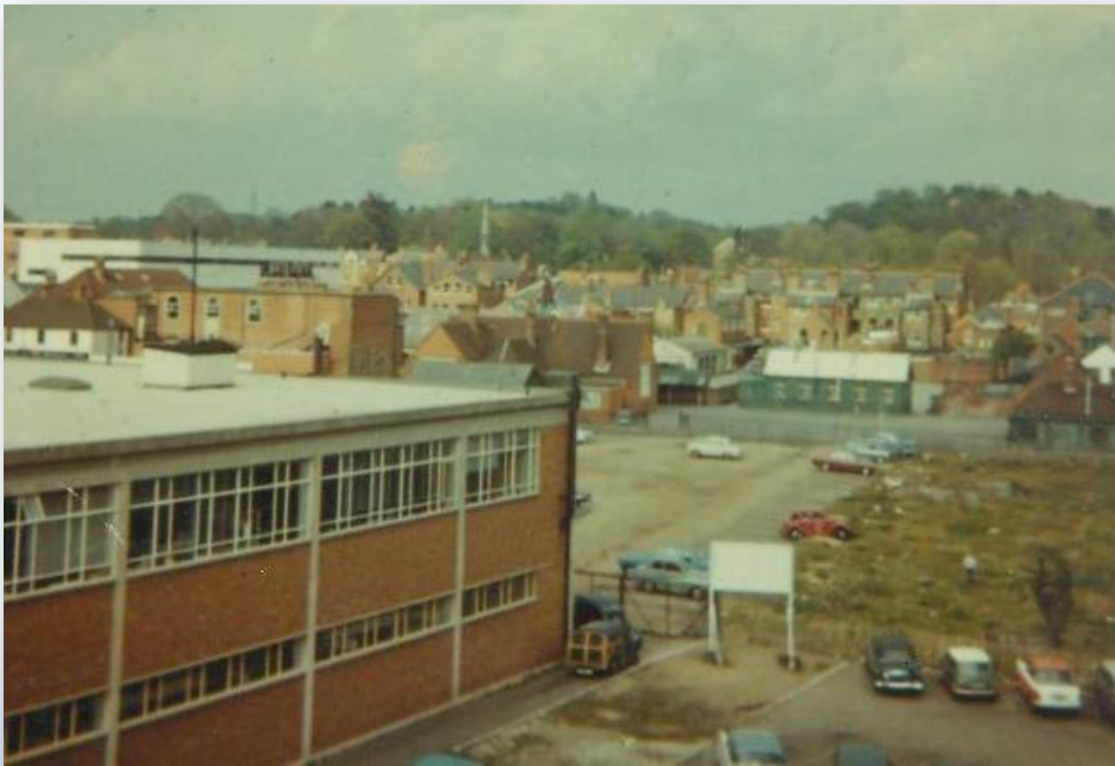
Camberley Centre 1964 looking toward Camberley Infant School Dinner hall