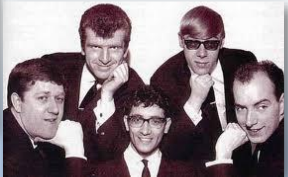
Freddie and the dreamers