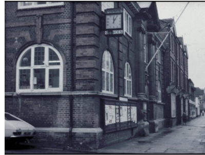
Frimley and Camberley UDC Offices, London Road