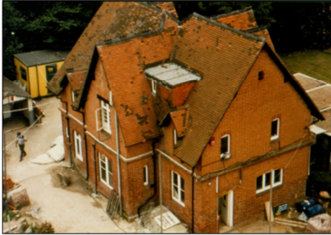
Newstead, Knoll Road