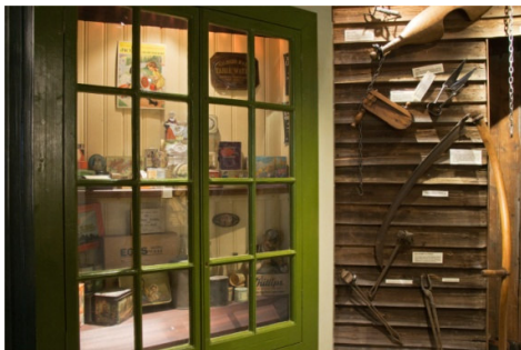
Museum Shop and farming display