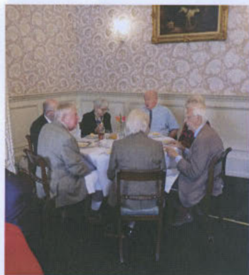
The President holding forth