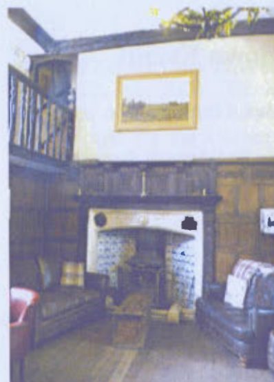
The Snoozing Room

Anxious to share recollections, and for sustenance, twenty one of us assembled at the Club. Lunch choices seemed to be biased towards some excellent roast beef, accompanied by enormous Yorkshire