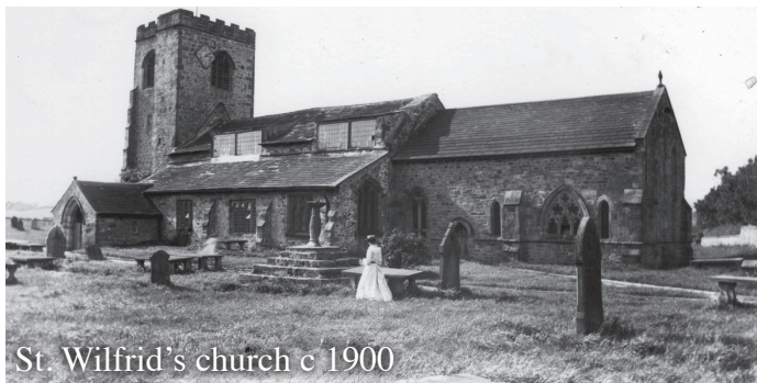
St Wilfrid's church c 1900