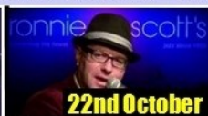
Ronnie Scott's 22nd October Superb quintet performing Jazz, Blues + Country & Western hits - £19.50