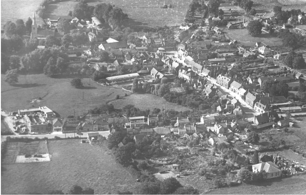
Princes Risborough from the South-East 1935 Bell Street traverses the foreground