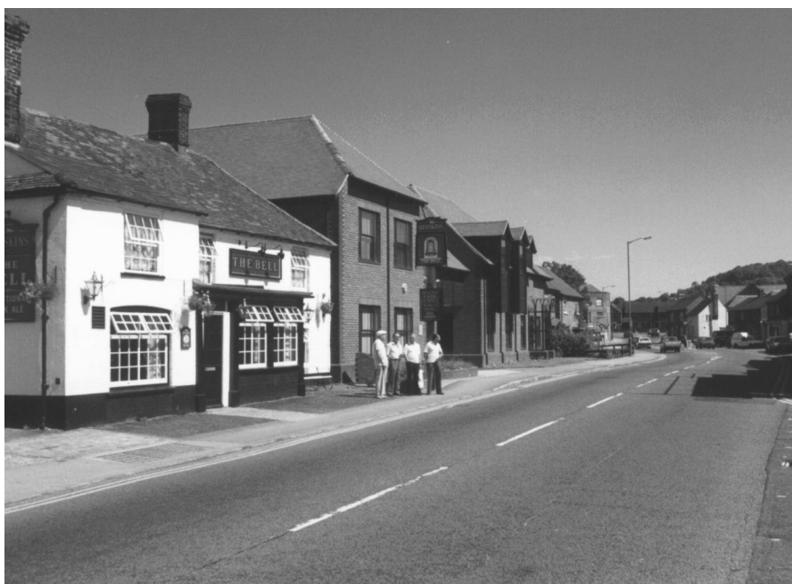
Bell Street in 1986 looking East