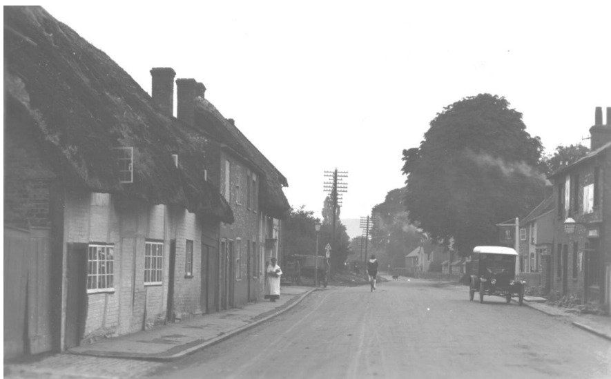
Bell Street, Princes Risborough, in the 1930s, looking West