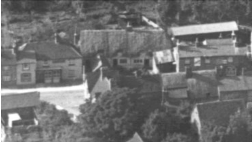
The Bell , White Lion Friendly Society Cottages and former Glaziers Arms (Detail from the photograph on the previous page)