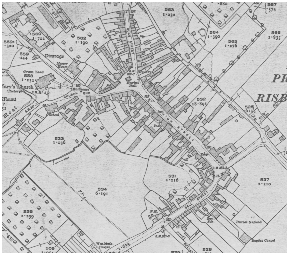
Princes Risborough in the 1926 Ordnance Survey

The Bell , marked P. H., is opposite Bell Lane. The White Lion Friendly Society cottages are behind and to its right and the former Glaziers Arms is to the right and in front of them. The White Lion faces the High Street on the other side of the road.