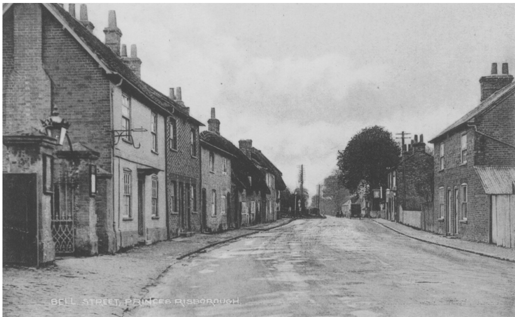
Bell Street in Thomas Bailey's Day The shop is just beyond the right hand telegraph pole