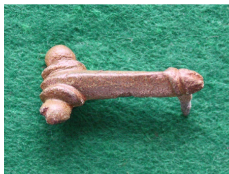
Phallic Mount for a Box