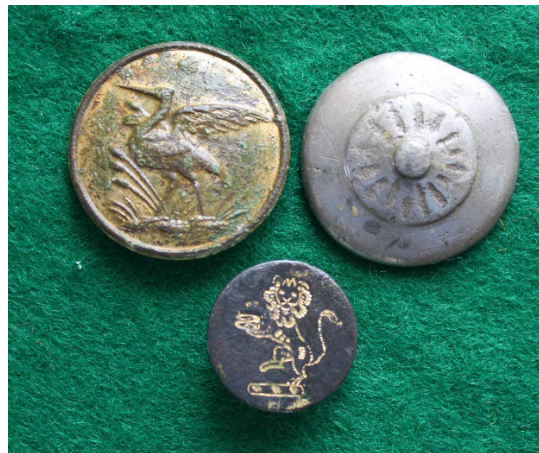
Two gilded Livery Buttons and one ornamental.