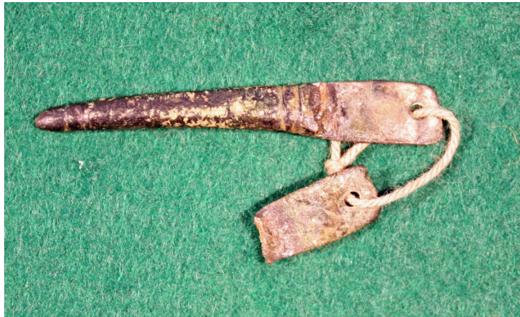
Bronze Strap-end c. 600 AD