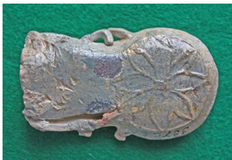
Pilgrim's Holy Water Ampulla 15thC