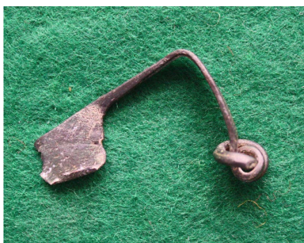
Graeco-Roman Bow Brooch 6thC BC