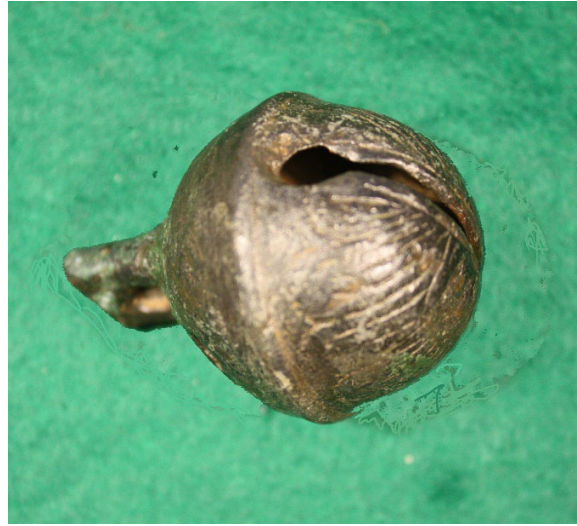
Rumbler Bell 16 th – 19 th C