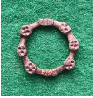
Ring Brooch 13 – 15thC