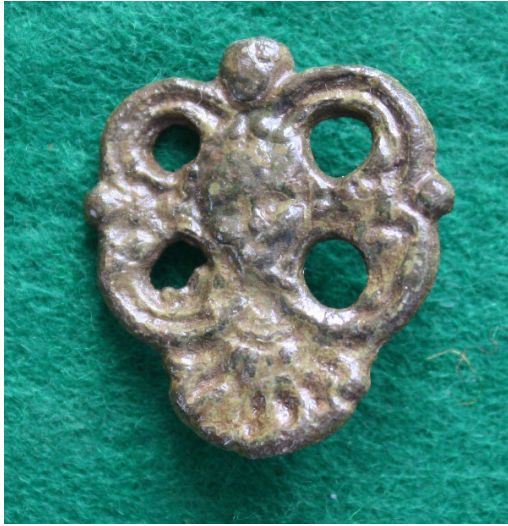
Harness Decoration 17 th C