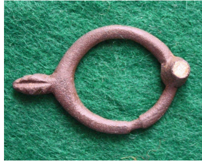
Ring Brooch with Paste Stone