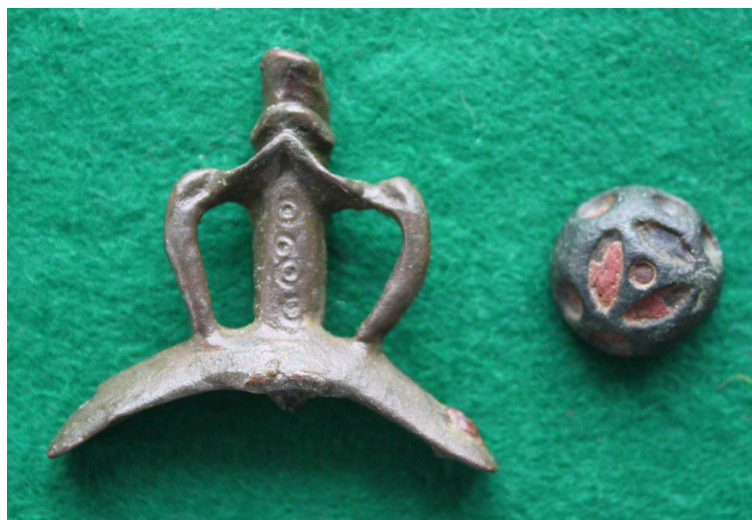
L. Possibly a Dagger Handle