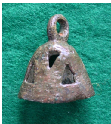
House Bell against evil Spirits