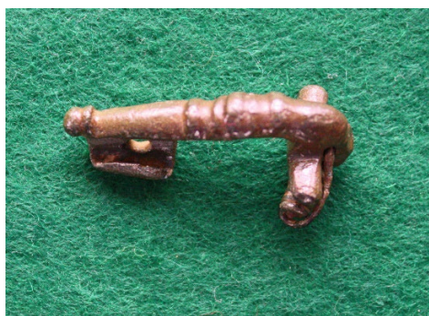
Brooch of Polden Hill Type