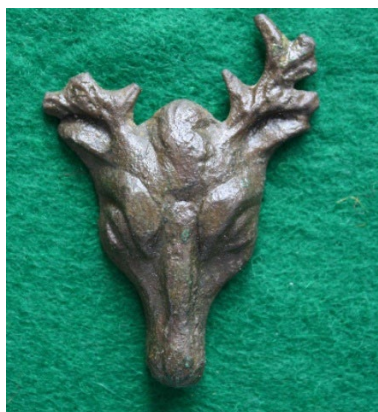
Stag's Head Chest Ornament