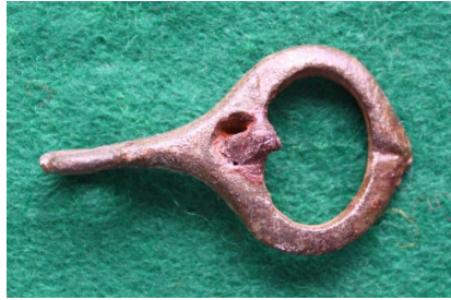
Spur Buckle 13 – 14 th C