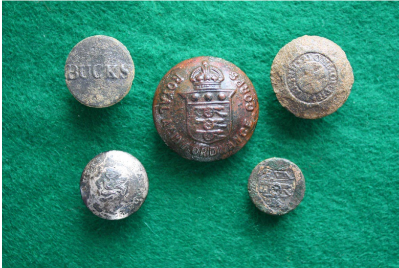
Centre: Royal Army Ordnance Corps: Outer Group clockwise from left: Bucks Yeomanry, Monmouthshire Regiment), Volunteer Artillery (possibly Bucks), Bucks Yeomanry