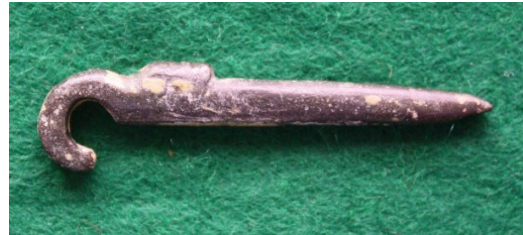
Ring Buckle Pins 13 – 15 th C