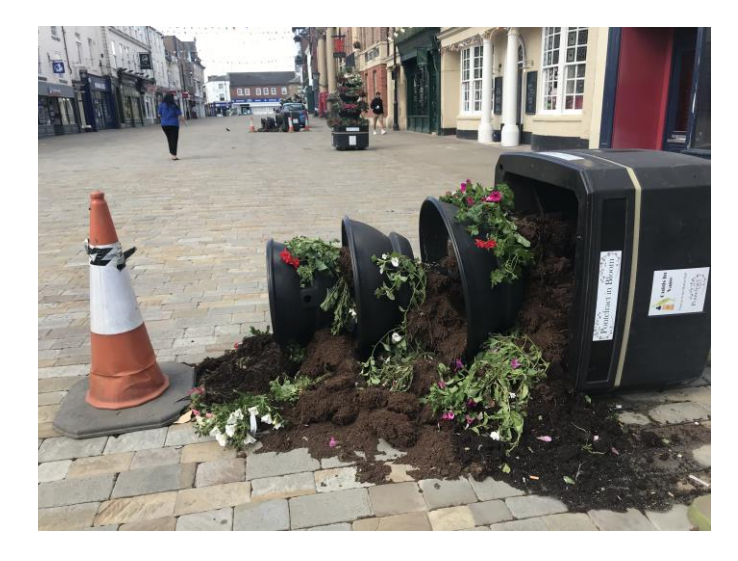
Saturday/Sunday 4/5th July - lockdown lifted!

Market place planters – below left Valley Road planters – below right