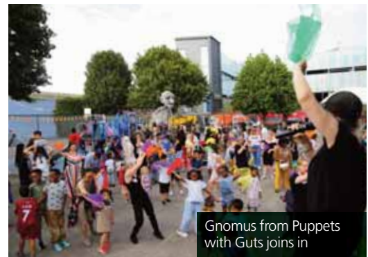
Gnomus from Puppets with Guts joins in