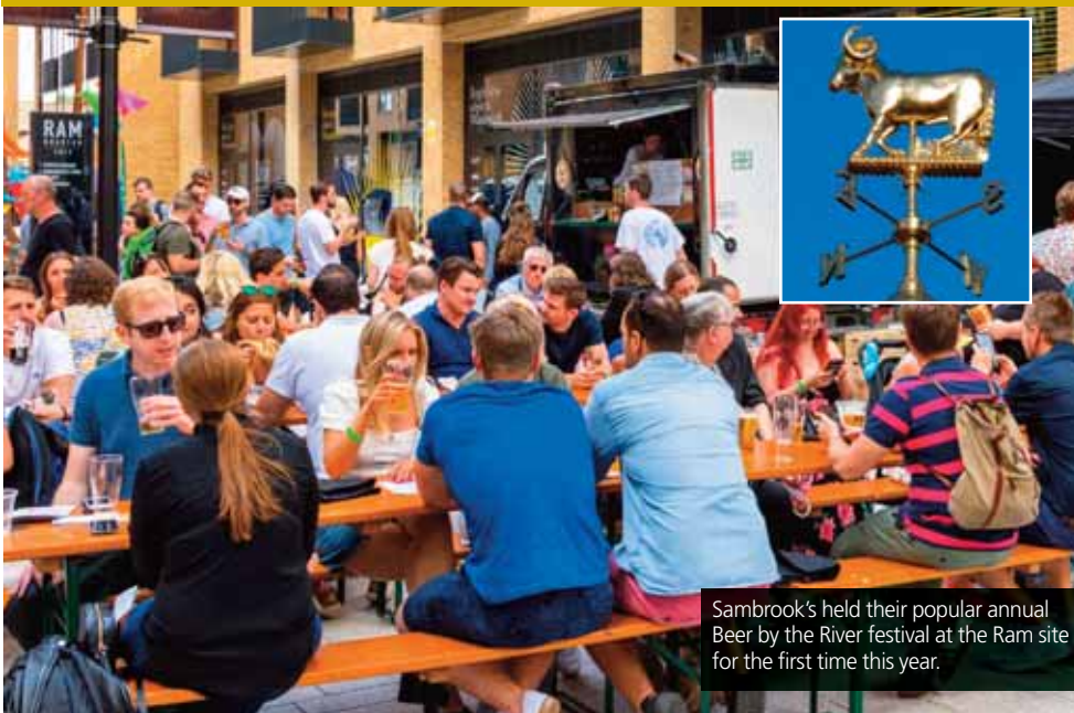
Sambrook's held their popular annual Beer by the River festival at the Ram site for the first time this year.

WANDSWORTH TOWN CENTRE'S 500-YEAR-OLD ASSOCIATION WITH BEER BREWING IS SET TO LIVE ON AS LONDON'S OLDEST INDEPENDENT BREWER SAMBROOK'S PREPARES TO MOVE TO THE RAM QUARTER.