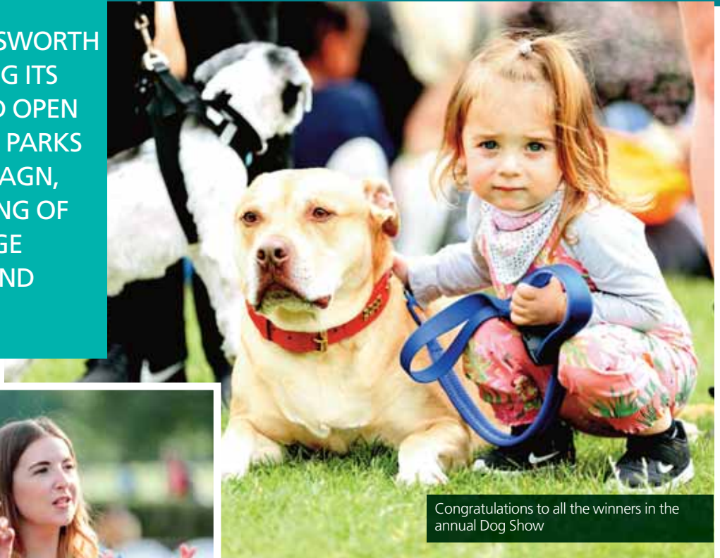
Congratulations to all the winners in the annual Dog Show

THIS SUMMER, WANDSWORTH HAS BEEN CELEBRATING ITS FANTASTIC PARKS AND OPEN SPACES WITH ITS LOVE PARKS WANDSWORTH CAMPAIGN, AND HAS HELD A STRING OF EVENTS TO ENCOURAGE PEOPLE TO GET OUT AND ENJOY THEM.