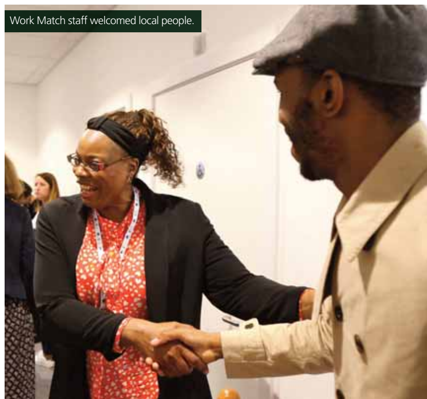
Work Match staff welcomed local people.

email: wandsworthworkmatch@wandsworth.gov.uk phone: 020 8871 5191 www.wandsworthworkmatch.org