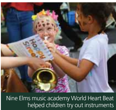
Nine Elms music academy World Heart Beat helped children try out instruments

More than 1,800 local residents and visitors gave the colourful Thessaly Road bridge a thumbs up as they joined in with free activities, workshops, live outdoor performances and music at the Happy Streets festival.