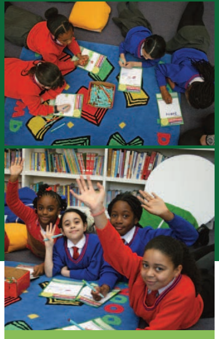
Pupils at Trinity St Mary's primary school, showing their artistic streak, as they complete their competition entries.

On top of that, the schools of the winning pupils - Honeywell Infant School, Swaffield Primary School and Trinity St