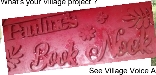
See Village Voice Autumn 2019