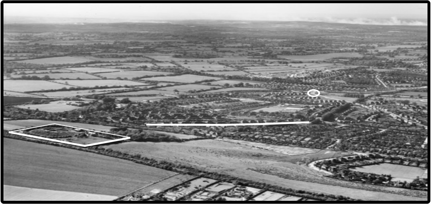
An aerial view over Onslow Village 1948 - Outlined are Henley Fort, Curling Vale and the A3 Cathedral roundabout.