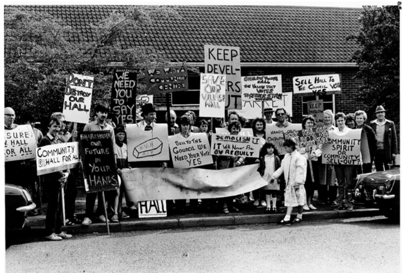
1984 - Save Our Hall campaign

ACRE (Action with Communities in Rural England) are concerned with the countries 10,000+ village halls, most of which date back to the 1920s. They have been offering Halls their interpretation of the Government rules and guidance which has been most helpful. To celebrate the contribution the Halls make to rural communities they held a Village Halls Week in late January and launched their virtual 'Domesday Book' to record the work the Halls are doing in 2021. Their hope is that this record will help make the case for sustained funding and support for village halls which will be especially important as the country recovers from the coronavirus pandemic. (Search on-line: ACRE Domesday - it is quite an impressive read)