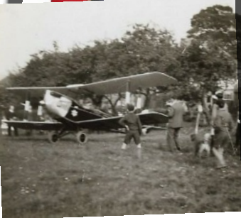
Prince Henry's Moth force landed in fields behind Orchard Road 1932