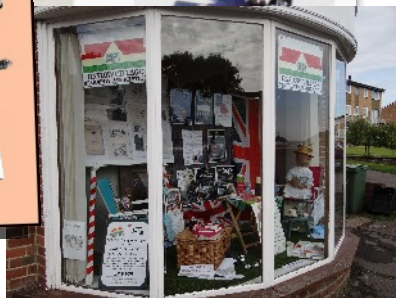
Williams Window 2014