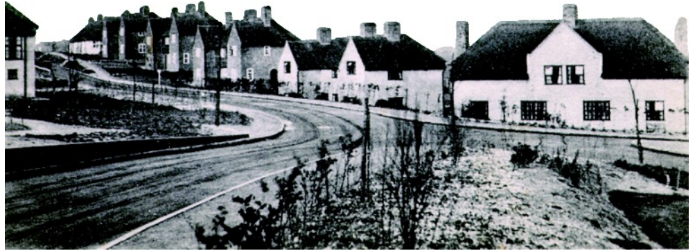
The view down Manor Way from The Crossways