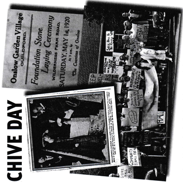
An original notice for the foundation stone laying ceremony; a press cutting showing the event itself; and a photo showing residents lobbying for the village hall to be retained for the community after Onslow Village Ltd was wound up in 1984.

For further details please ring Marian on 07720 945430.