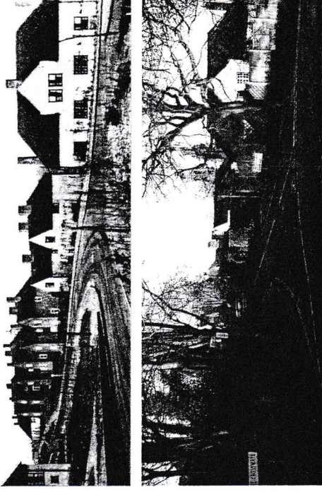
The Crossways in the 1920s and below, as it looks today

We hope to be able to add some of the Onslow Village photos to Historypin and will report back on our progress.