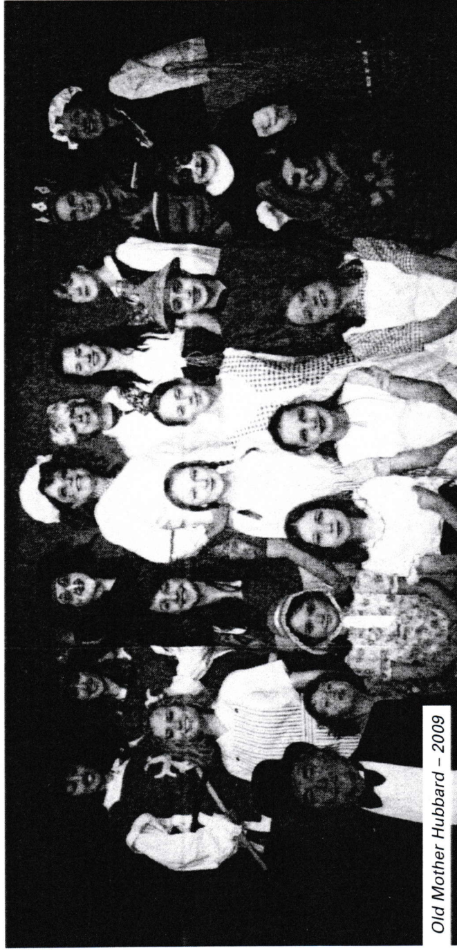
Old Mother Hubbard – 2009