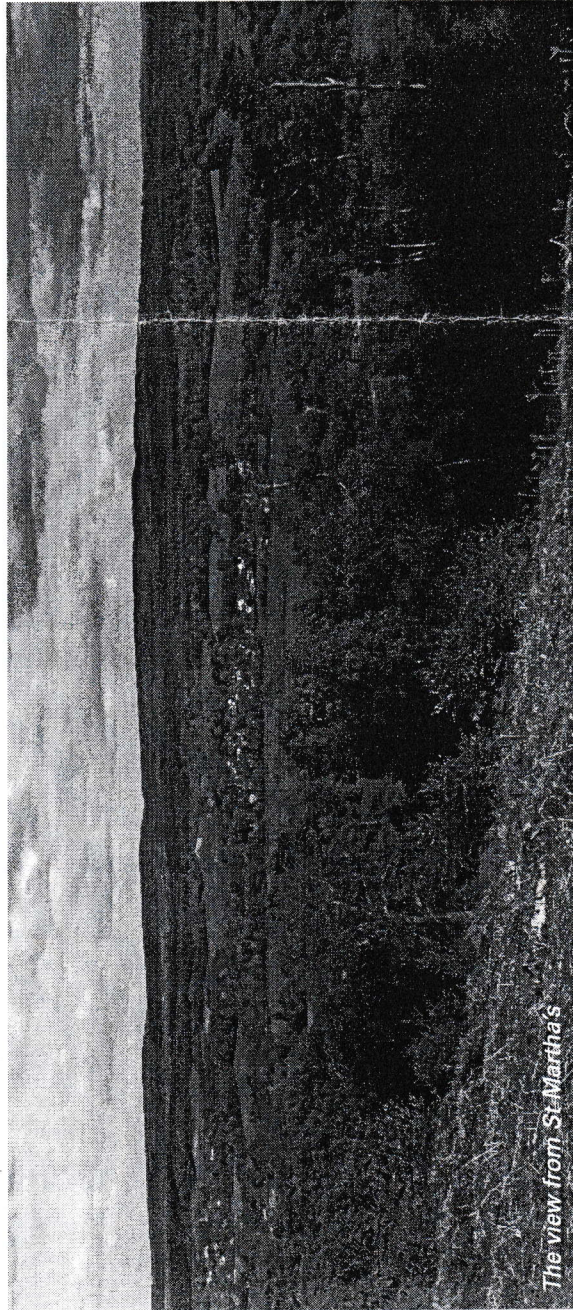
The view from St Martha's

According to the magazine "Country Walking," in 2008, 3.6 million people joined a gym at an average of cost of £372, yet 500,000 never went and a further 800,000 only went once or twice a month. If that strikes a chord, why not take up walking instead? It's not just your bank balance that will feel the benefit. Research from the US shows that just three hours a week of brisk walking can actually reverse the deterioration caused to the brain by the process of ageing and it also boosts the body's ability to fight disease by stimulating the production of white blood cells. Tony Reed has kindly provided the following article with his suggestions for walks from