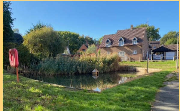
Durban Lane Pond