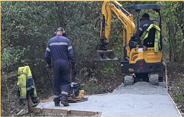
Nature Reserve New Footpath