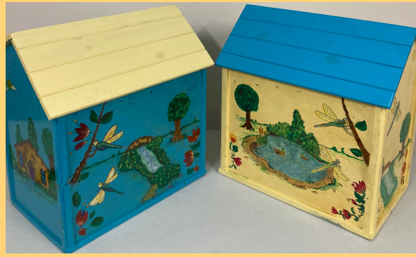
Two Little Lending Libraries

A new pathway recently installed in the Nature Reserve will make a huge difference to the many residents who enjoy walks in the reserve. This was a joint Parish Council and Basildon Council investment