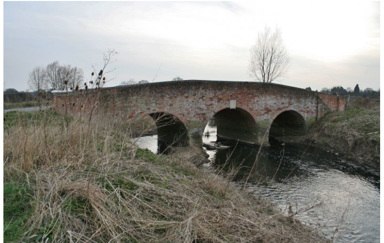
These show the bridge before and after the recent repairs.

Is a Grade II Listed Building. It is a plain red brick C18 bridge of 3 arches with stone capping to the parapet. On the north side the central arch has a stone keystone inscribed "County 1770".