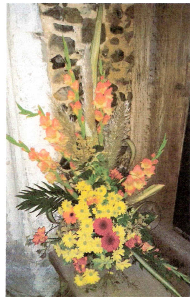
Harvest thanksgiving flower displays for the font and the porch - 16th October