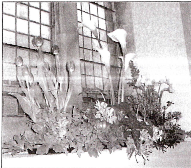
These photographs were taken on Easter Sunday.