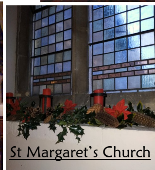
St Margaret's Church

We would be pleased to receive your photos of village events or village scenes