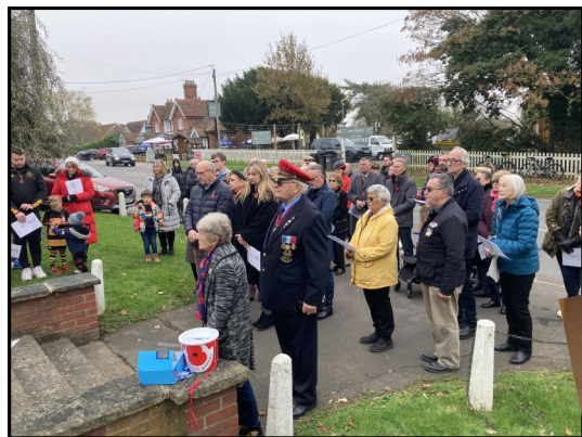
War Memorial - Remembrance Sunday

War memorial. In need of a clean and overhaul. The weeping pear trees have been pruned.