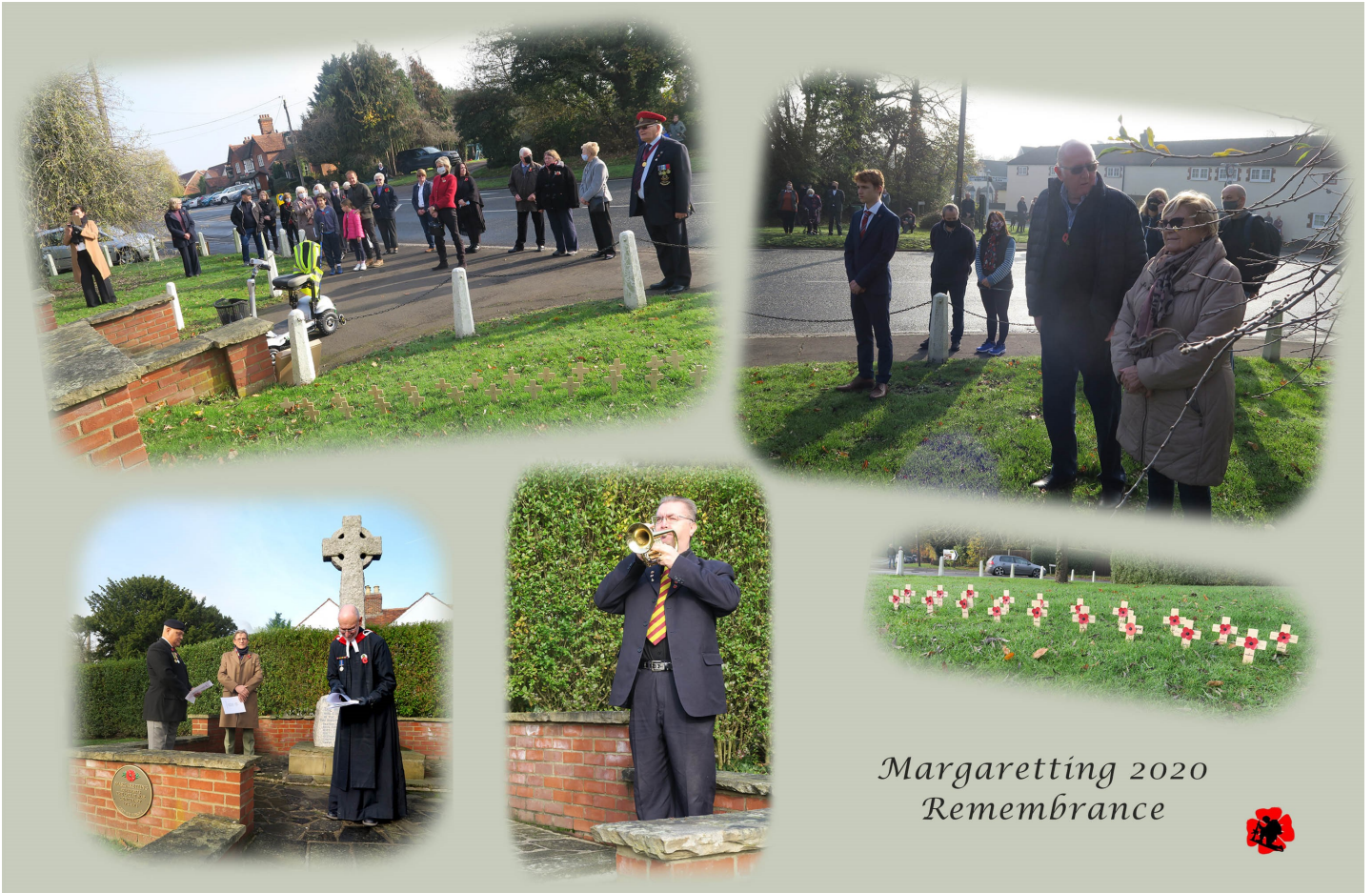
Margaretting 2020 Remembrance